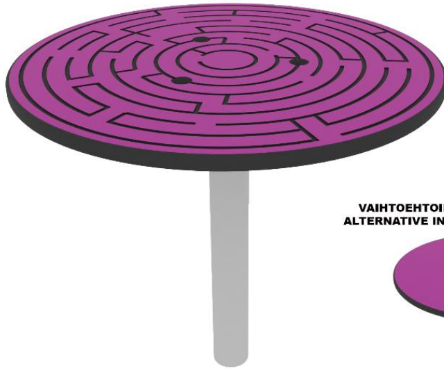
VAIHTOEHTOINEN ASEENNUSTAPA ALTERNATIVE INSTALLATION METHOD