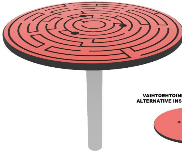
VAIHTOEHTOINEN ASEENNUSTAPA ALTERNATIVE INSTALLATION METHOD