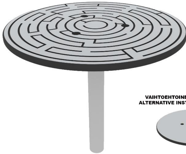
VAIHTOEHTOINEN ASEENNUSTAPA ALTERNATIVE INSTALLATION METHOD