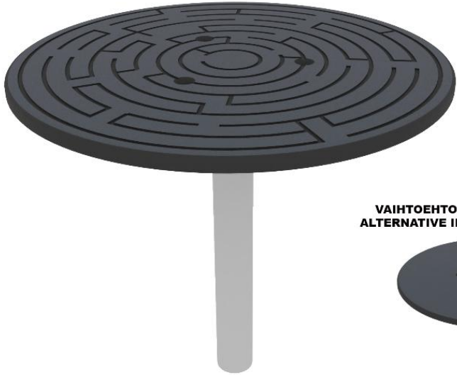
VAIHTOEHTOINEN ASENNUSTAPA ALTERNATIVE INSTALLATION METHOD